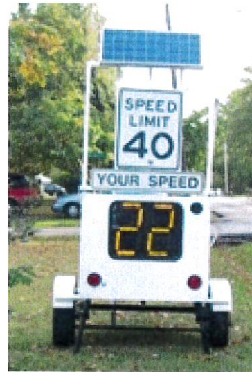
Mobile Radar Speed Sign.